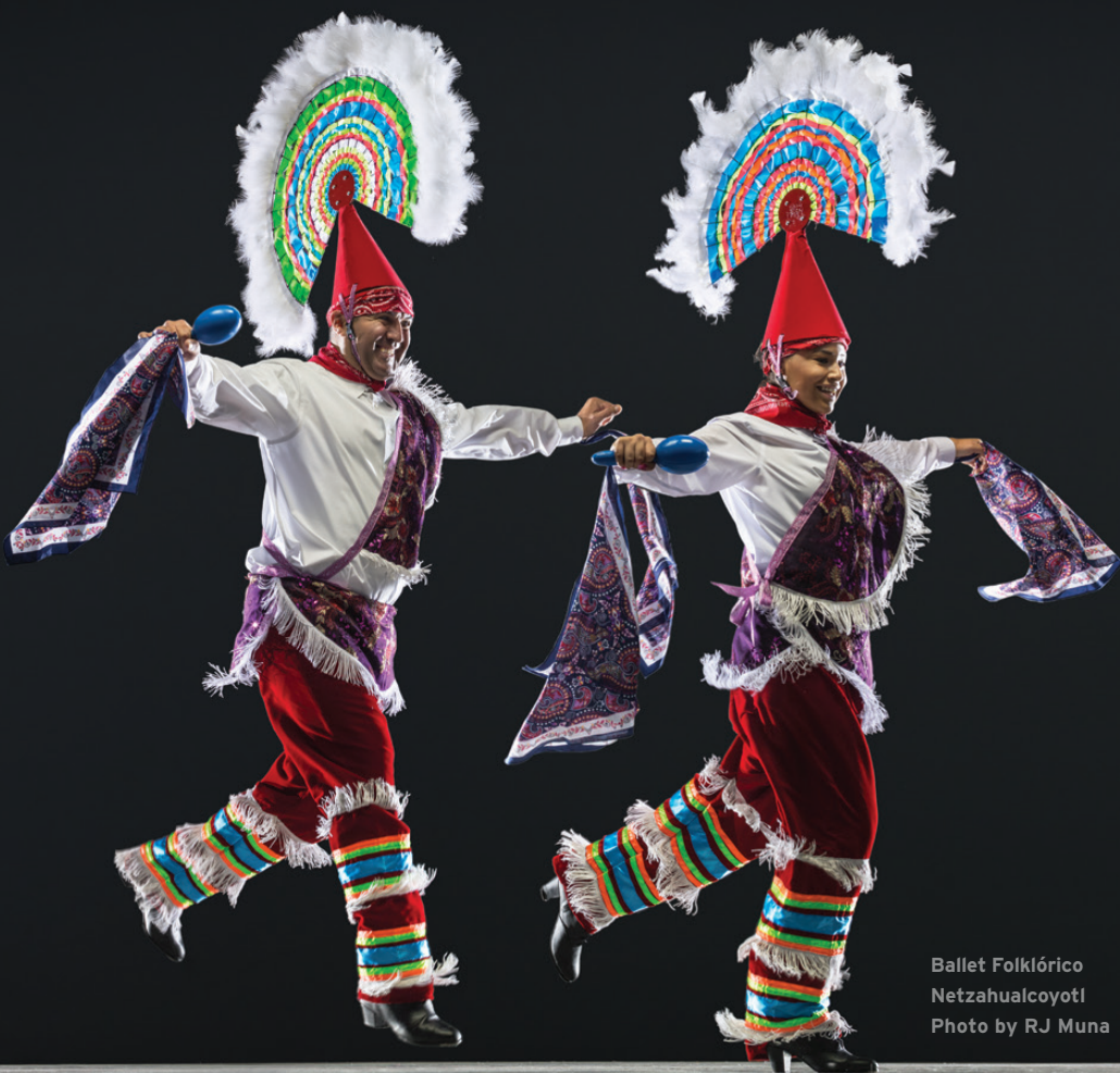
Ballet Folklórico Netzahualcoyotl