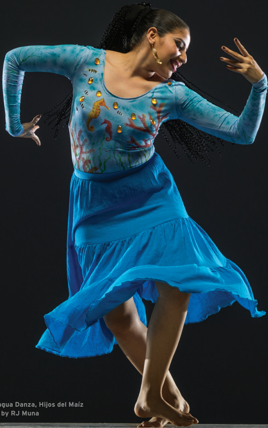
Nicaragua Danza, Hijos del Maíz

Weekend 2 features dances and music from India, Indonesia, Mexico, Nicaragua, the Philippines, Scotland, South Africa, Spain, and Tajikistan.