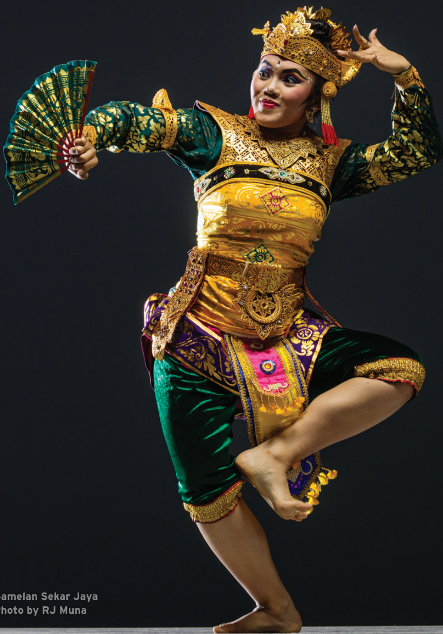
Gamelan Sekar Jaya