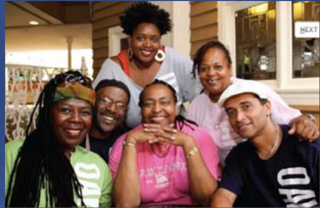
Cultural Heritage Choir